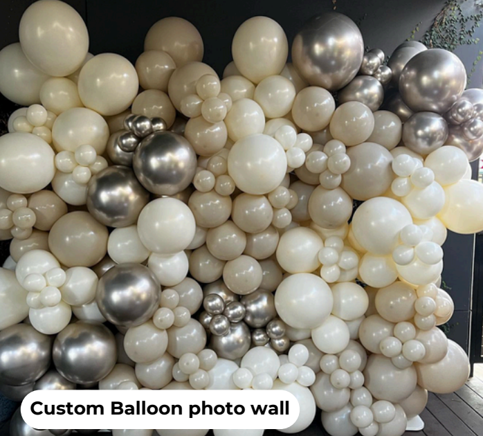
Custom Balloon photo wall