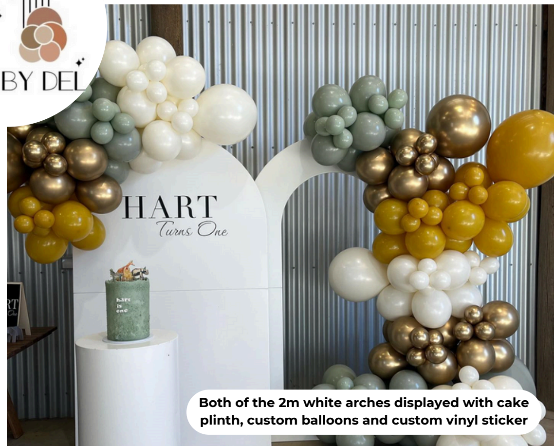
Both of the 2m white arches displayed with cake plinth, custom balloons and custom vinyl sticker