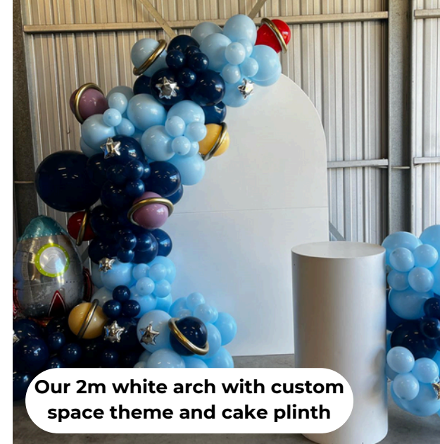
Our 2m white arch with custom space theme and cake plinth