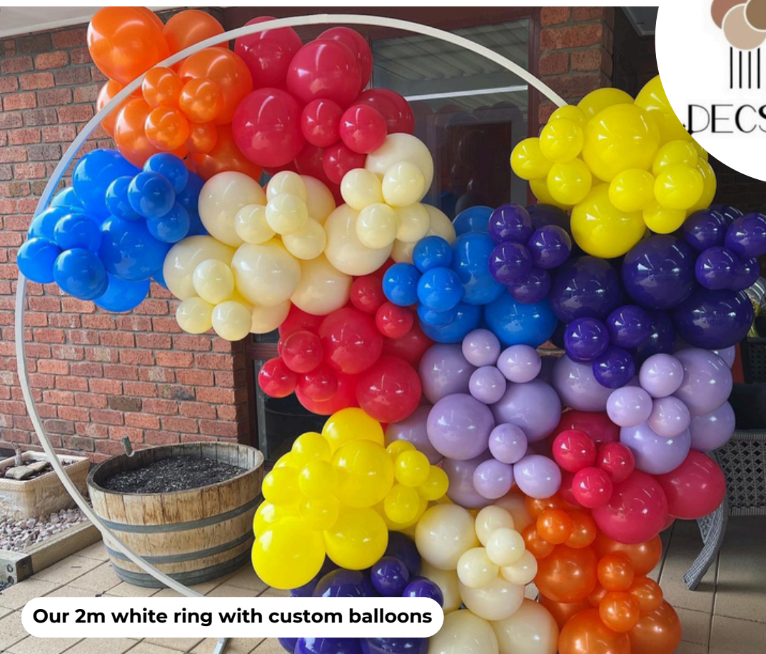
Our 2m white ring with custom balloons