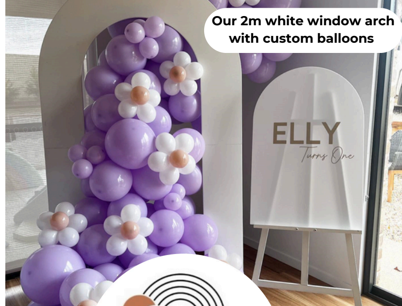
Our 2m white window arch with custom balloons