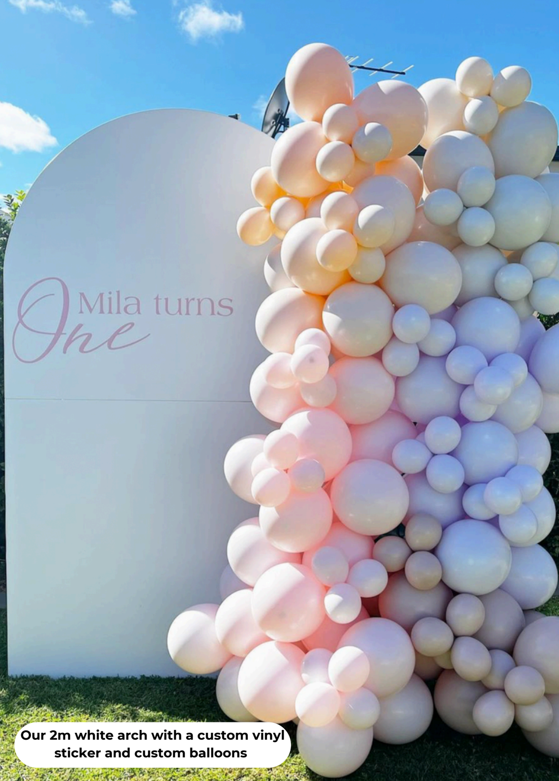
Our 2m white arch with a custom vinyl sticker and custom balloons